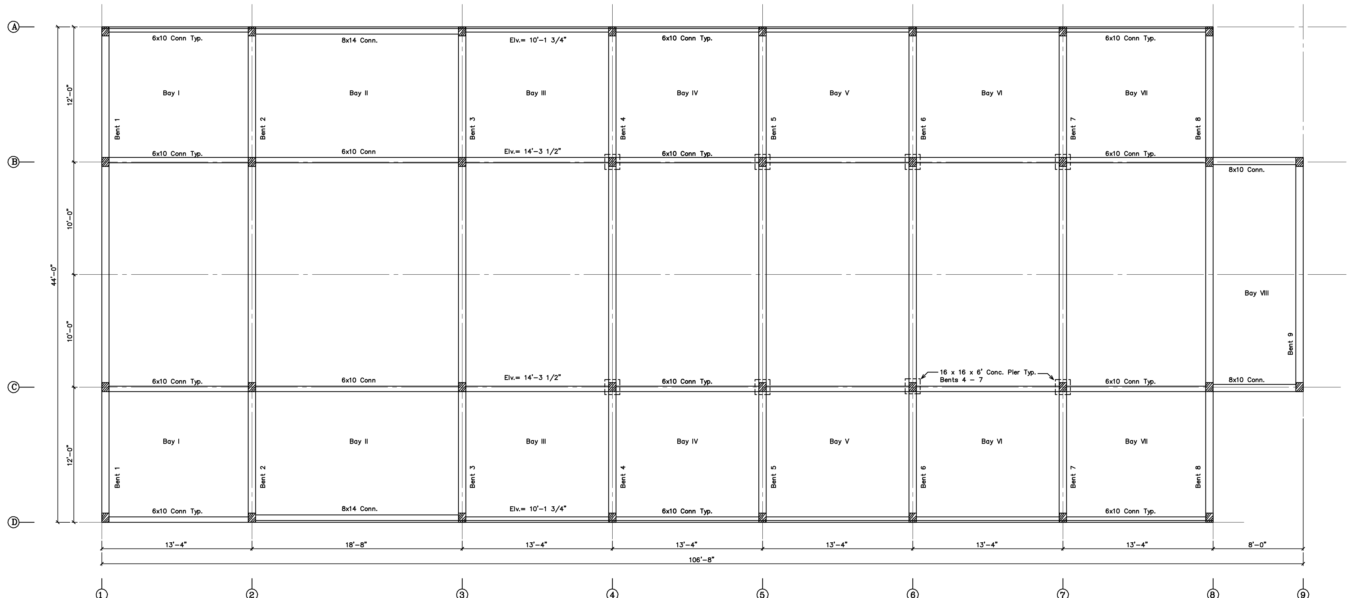
Lower Plate Level Plan