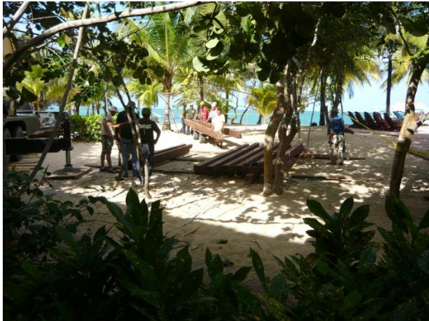
All hands helping to bring parts close to site @ 2:50