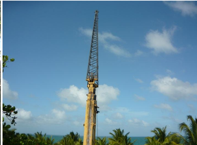
and the big guy reporting for duty @ 2:56