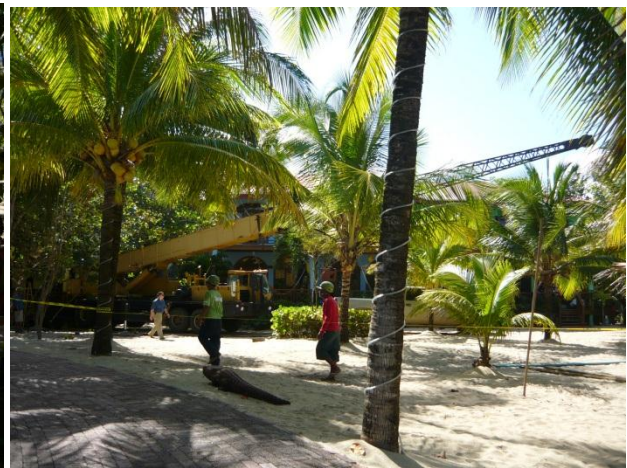
1 pm the crane arrives at its spot and by 2:15 pm it is getting ready to do its special job